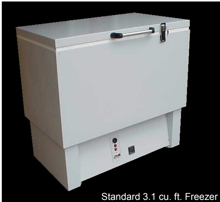
Standard 3.1 cu. ft. Freezer