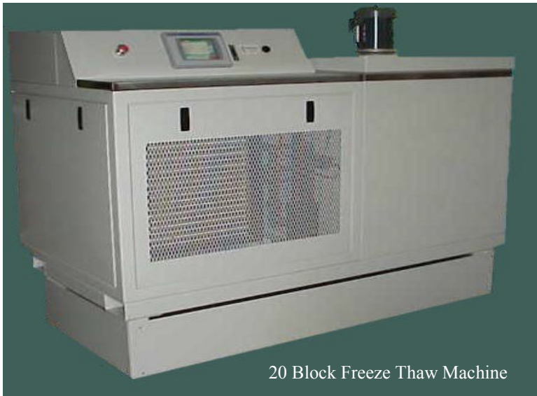
20 Block Freeze Thaw Machine