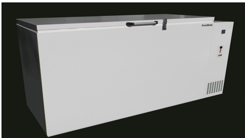
Standard 21 cu. ft. Freezer