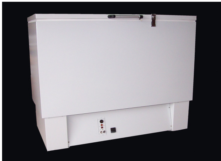
Standard 12 cu. ft. Freezer