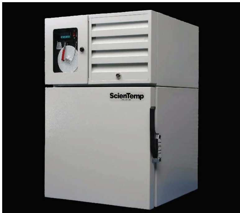
Model 1.0 cu. ft. with optional 4" Chart Recorder