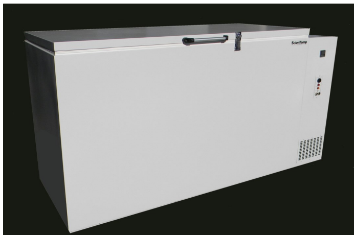
Standard 21 cu. ft. Freezer