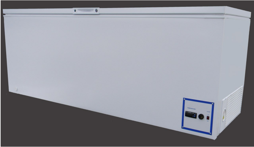
Standard 25 cu. ft. Freezer