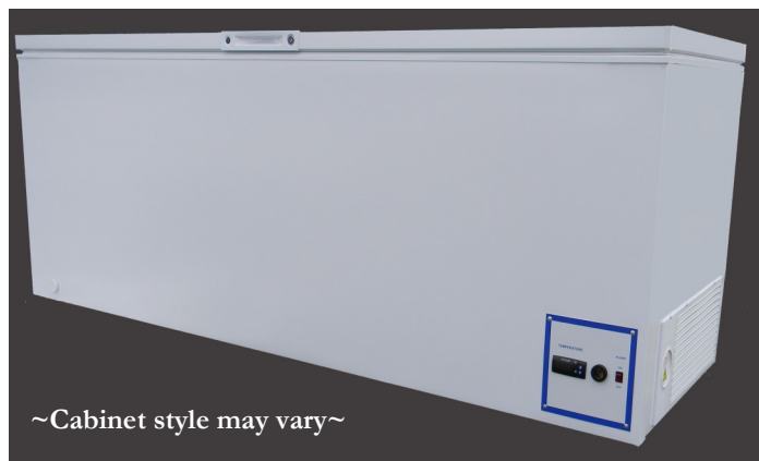
Standard 20 cu. ft. Freezer