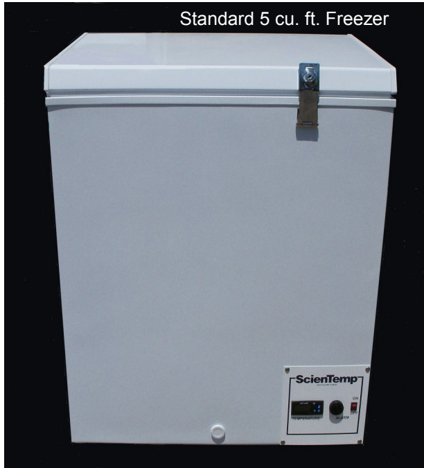
Standard 5 cu. ft. Freezer