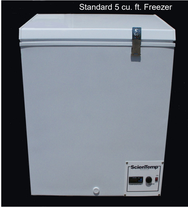
Standard 5 cu. ft. Freezer