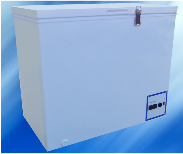
Standard 9 cu ft Freezer