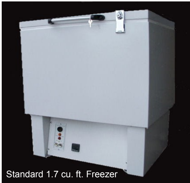
Standard 1.7 cu. ft. Freezer