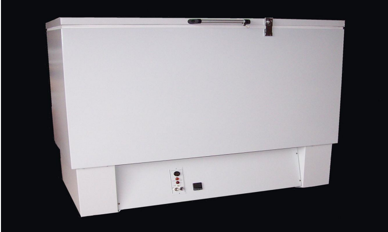
Standard 6.8 cu. ft. Freezer