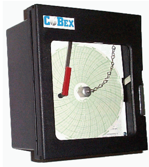
6 inch, Single Pen, Chart Recorder for all models (except 1.0 cu ft)

These recorders are highly versatile and well suited for the recording and monitoring of the temperature inside the freezer. Reliability and precision assure accurate results.