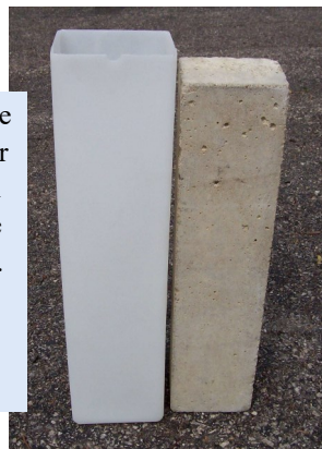
Plastic sample containers for Procedure A are available for purchase.

*Specimen racks and machines can be customized.