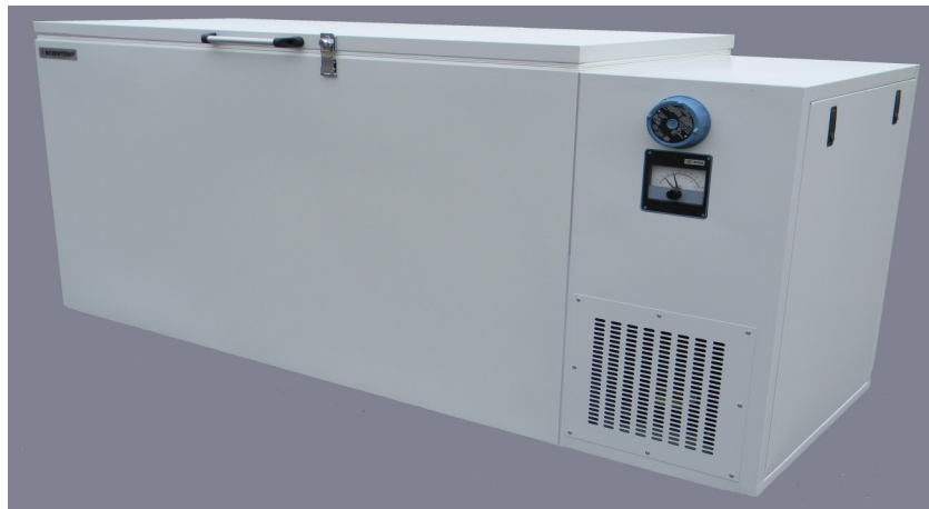
Standard Explosion Proof 21 cu. ft. Freezer