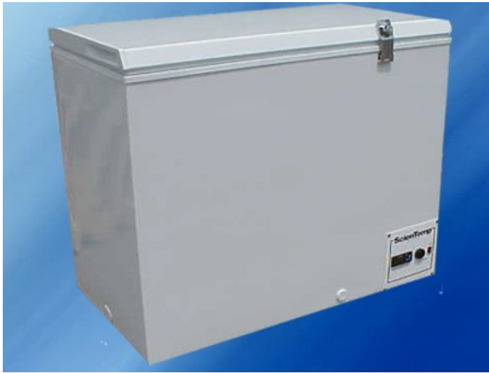
Standard 7 cu ft Freezer