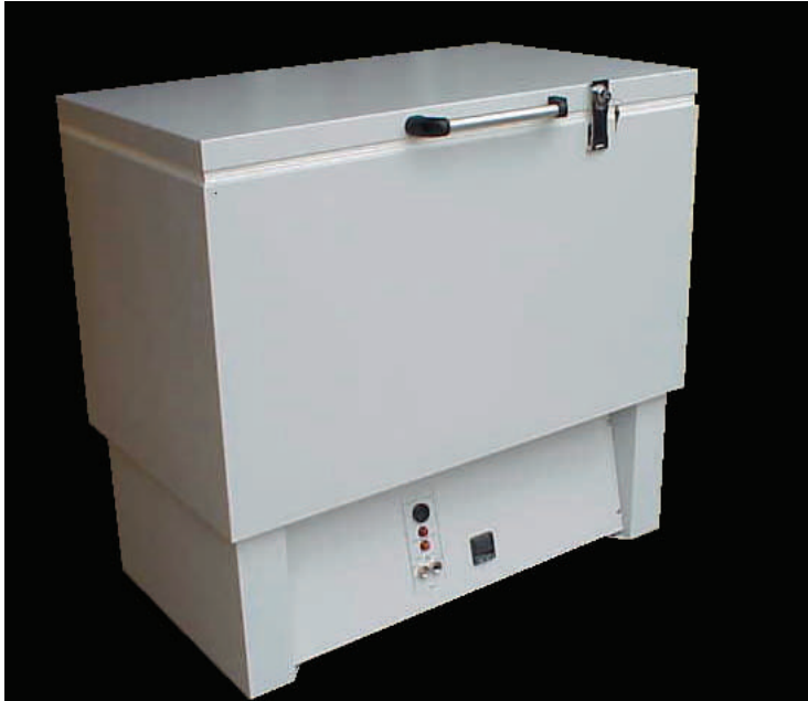
Standard 3.1 cu. ft. Freezer