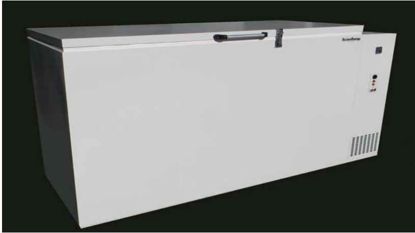
Standard 21 cu. ft. Freezer