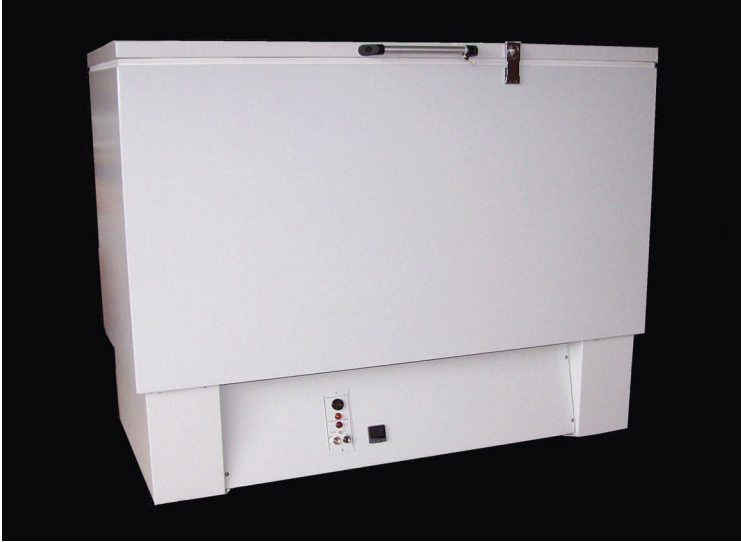
Standard 12 cu. ft. Freezer