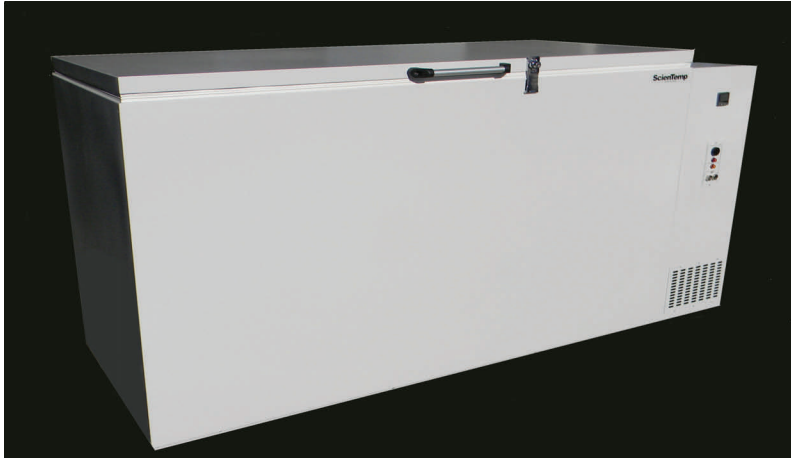
Standard Low Profile 12 cu. ft. Freezer