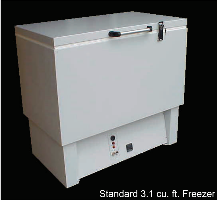
Standard 3.1 cu. ft. Freezer