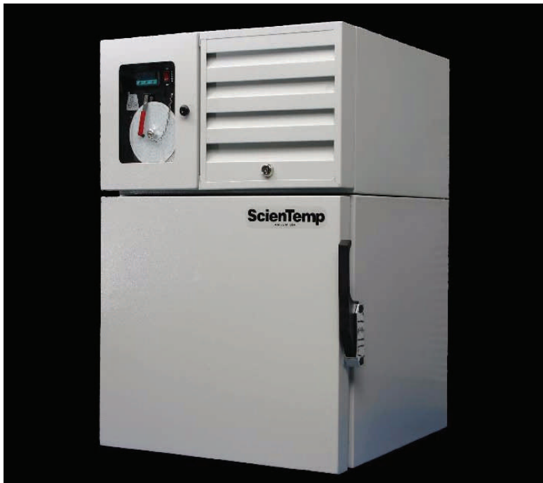
Model 1.0 cu. ft. with optional 4" Chart Recorder