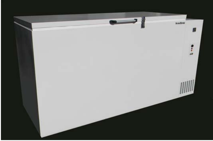
Standard 21 cu. ft. Freezer