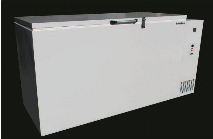
Standard Low Profile 12 cu. ft. Freezer